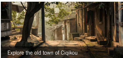
Explore the old town of Ciqikou